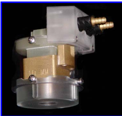
Manufactured under license from Vitesse Semiconductor

Any Model 8000 Handler can be upgraded for Hot and Cold test. Equipped with two Heat Exchanger heads, the 8000 allows a DUT to be tested at ambient, again at high temperature, and again at low temperature, all in just one insertion. The DUT is first clamped with the handler's ambient pick up head and tested. If it passes, the pick up head leaves the DUT in the test socket. The DUT is then clamped with the Hot Heat Exchanger and tested. If it passes, the hot head moves and the Cold Heat Exchanger clamps down on the DUT for the third time. The DUT is then sorted and a new cycle begins.