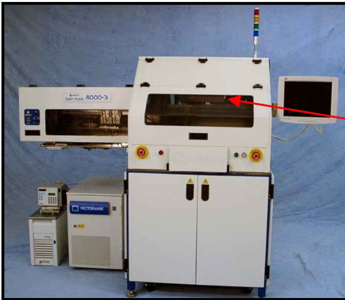
Shown with Trumpf VMC-3 Laser Marker