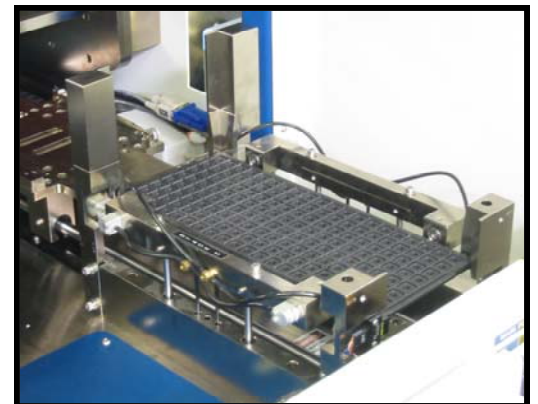
Input tray stacker mechanism Each stacker has an in & out stack The 8000-V allows up to 5 stackers