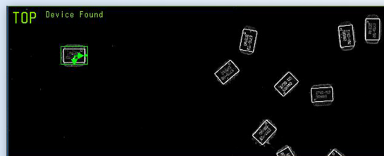
Top inspection locates and identifies devices