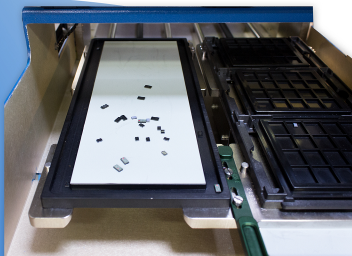
Devices are presented scattered on the input tray and sorted by device size to the output tray or tape